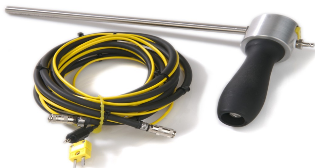
9' L x 3/8" O.D. Inconel probe with 10' viton hose

Built in Printer: 2" Graphic Thermal Printer